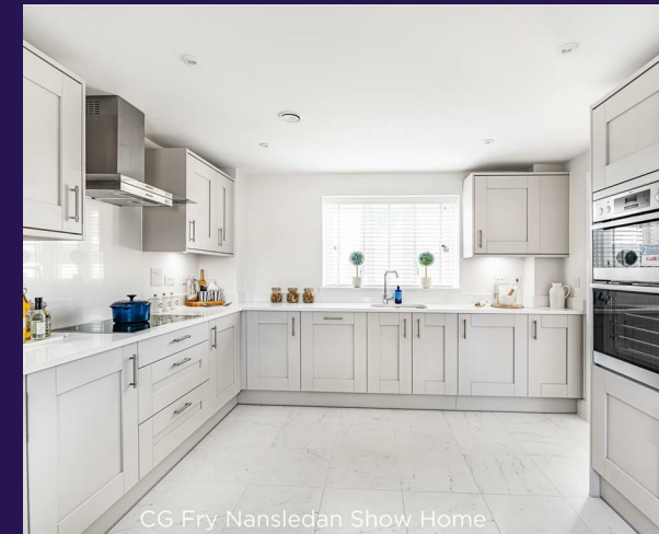
CG Fry Nansledan Show Home